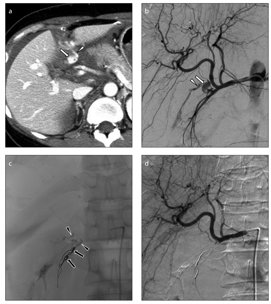
Figure 2. a – d . A 44-year-old woman (Patient 7) with abdominal pain after an assault one day previously. An enhanced, axial CT scan image ( a ) shows a pseudoaneurysm ( arrow ) with contrast extravasation ( arrowhead ) at a branch of the gastroduodenal artery with hemoperitoneum. Common hepatic arteriogram ( b ) shows a pseudoaneurysm ( arrow ) with contrast extravasation ( arrowhead ) from the branch of the gastroduodenal artery. Distal pancreaticoduodenal arteries were embolized using two microcoils ( arrows ), and the pseudoaneurysm was then embolized with NBCA ( arrowheads ) ( c ). Completion common hepatic arteriogram ( d ) shows no further bleeding. The superior mesenteric arteriogram also shows no bleeding focus (not shown).

Nowadays multidetector CT is recognized as a primary tool in the diagnosis of traumatic injuries to the bowel and mesentery in stable and semi-stable patients (10). Previous reports indicate that multidetector CT has a high negative predictive value, but there is variability in the sensitivity and accuracy of CT for the diagnosis of bowel and mesenteric injuries requiring surgery (13, 14, 18).